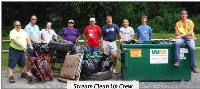
Stream Clean Up Crew