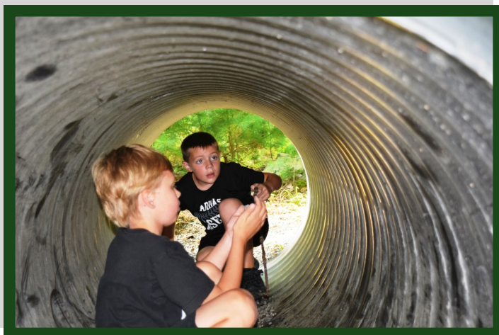
Right: Day campers are the first to explore Lilliana's Nature Discovery Area