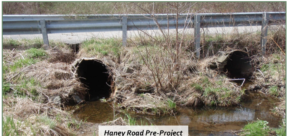
Haney Road Pre-Project

The Monroe County Conservation District Quality Assurance Board (QAB) recommended three municipal grant applications to the District Board for funding in May of 2017. The Dirt Gravel & Low Volume Road Program (DGLVR) provides grant monies to eligible state and local government entities for road maintenance/