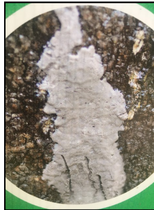
Spotted Lanternfly Egg Mass

We have now entered into the time of year where the spotted lanternfly (SLF) has reached its adult stage. This is an important time to help combat these invasive pests because not only are they easier to see at this time, but this is also when they start laying their eggs! Each egg sack you find may contain up to 50 individual SLFs!! It is important to know what the egg sacks look like so you can scrape them off whatever surface they are on, into a plastic bag filled with alcohol, and destroy up to fifty SLFs in one shot. The egg masses are about one inch long and will have a grey color to them as opposed to the gypsy moth egg sack which is more brownish-tan. It is also important to note that people often mistaken harmless lichens, which are even a sign of good air quality, for SLF egg masses. Lichens are often patchy, flakey, crusty and have a green hue to them and are often abundant on the tree and/or rock they are living on. If you think you have SLF egg masses on your property, give us a call at 570-629-3060 and we will help you with the next steps. 🍁