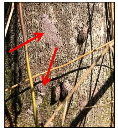
Spotted Lanternfly Egg Masses