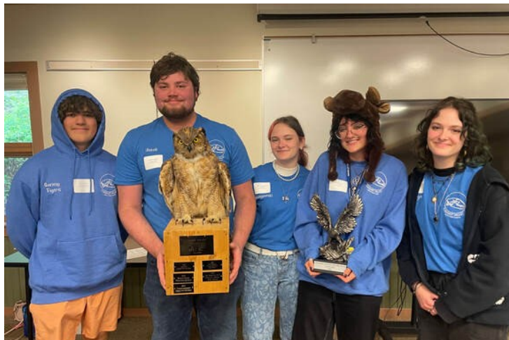
The "Swamp Tigers" Team of Pleasant Valley High School