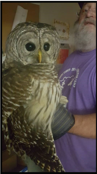
Barred Owl, discovered in a net on October 10 th , 2018