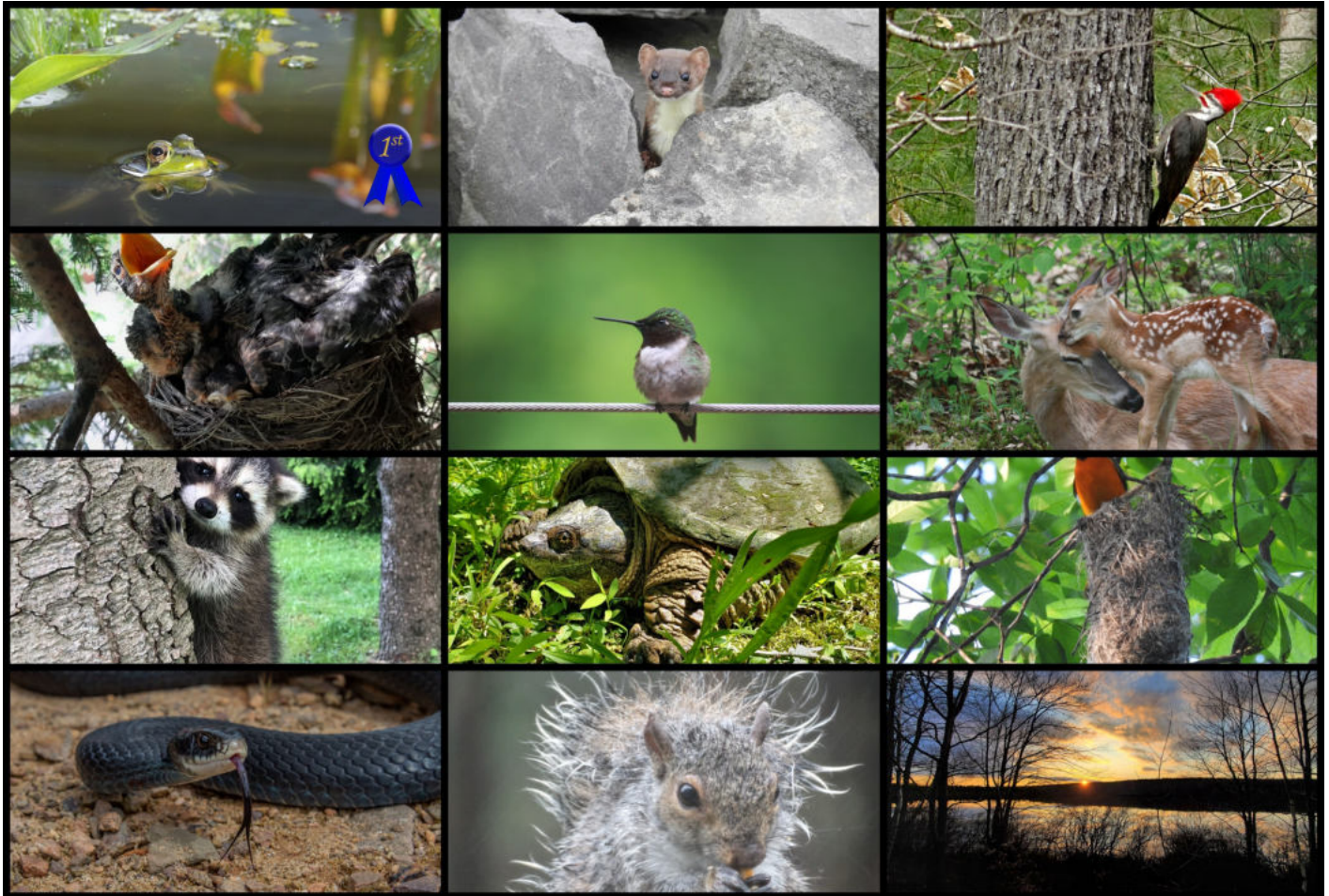
PHOTO CONTEST WINNERS ANNOUNCED