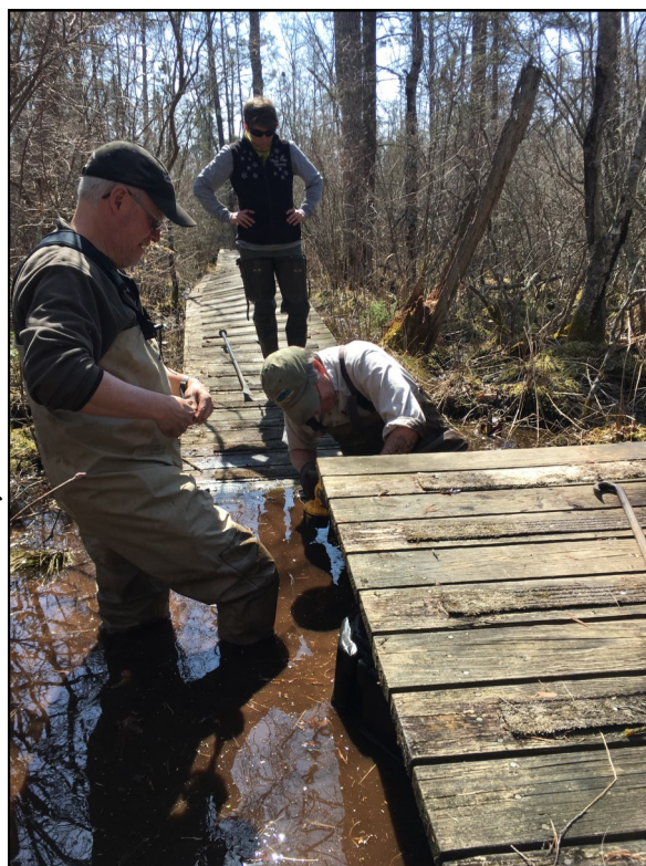
Staff and Volunteers working to fix the boardwalk

After two days, the new barrels were in place and the walkway was restored to again provide a safe passage into the Bog's interior. The new design has proven to work very well and has been tested by countless 4th graders on their annual spring visit to the Bog. They have been treated to the sight of many plants in bloom, wood frog tadpoles and their favorite, fresh otter scat, on the boardwalk where it floats above Cranberry Creek. The experience gives them a new look at a habitat that is drastically different from their backyards. It is always interesting to hear their comments when walking into the Bog. They are truly fascinated by the experience. The boardwalk has allowed that experience for 4th graders since 1982 and it will continue to open up the interior of the Bog for people of all ages in the future.