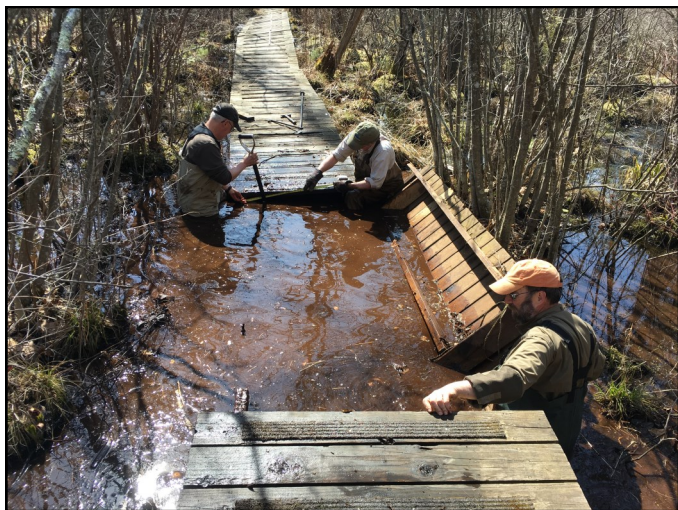
Staff and Volunteers working to fix the boardwalk