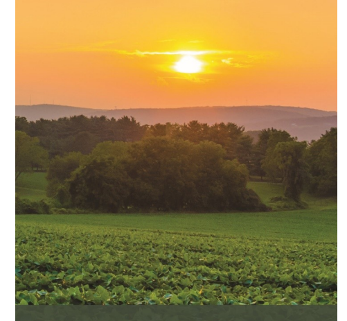
Created through the Clean Streams Fund, ACAP (Agricultural Conservation Assistance Program) provides financial and technical assistance for the implementation of best management practices in Pennsylvania. Administered by the PA State Conservation Commission (SCC) and delegated County Conservation Districts.

Pennsylvania ACAP Funding for Agricultural Best Management Practices