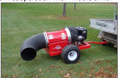
A power blower, used by Middle Smithfield Township's Public Works Department for Dirt and Gravel Road Maintenance

field Township's Public Works Department will host a workshop demonstrating road maintenance techniques using a power rake box and a power blower. Middle Smithfield Township currently uses this equipment for road and shoulder grading on dirt and gravel roads. The workshop will cover the basics of road surface maintenance goals and methods for attaining durable surfaces and drainage. Reducing maintenance intervals and surface material erosion saves money and time, and it's good for the environment! The workshop is FREE and open to road supervisors, maintainers, and operators. Meet at the McDade Trail parking area on Freeman Tract Road in the Delaware Water Gap National Recreation Area. Lunch will be provided. For more information and to register, call John Motz at MCCD at 570-629-3060. Registration is on a first-come basis. \blacklozenge