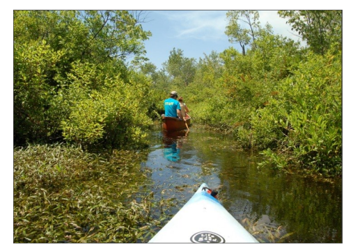
Cranberry Creek as it flows through the Tannersville Cranberry Bog

But the Cuyahoga River was only the poster child for polluted water. Most of the Nation's rivers were so fouled they were not safe for fish or humans. Fueled by public outrage, 96 republicans joined 151 democrats to override President Nixon's veto to pass the Clean Water Act (CWA). The CWA protected the Nation's wetlands and streams all the way to the headwaters because we all knew that most pollution did not come