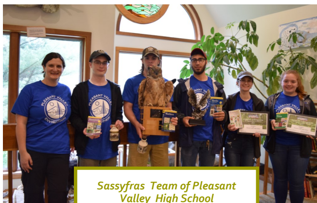
Sassyfras Team of Pleasant Valley High School

Highest Score for Wildlife - "Out of the Box Turtles" of Pocono Mountain West High School